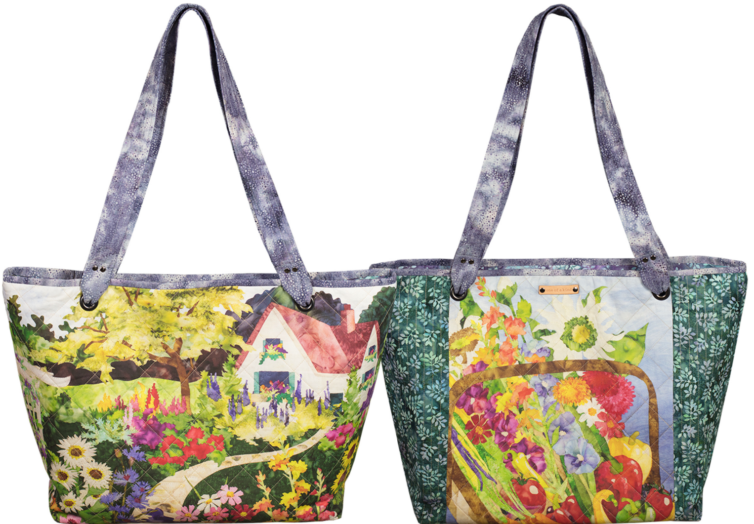
Tote Front: IFB01-P- Ka-Bloom!